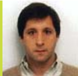
Duarte Bravo Amaral Export Department

RESUL nowadays sees itself as an essentially creative and imaginative company where are study, conceived, developed, produced and commercialized equipment supply solutions for transport and distribution of energy (electricity and gas), telecommunications, public lighting and water networks and also solutions related to renewable energies.