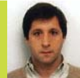
Duarte Bravo Amaral Export Department

RESUL nowadays sees itself as an essentially creative and imaginative company where are study, conceived, developed, produced and commercialized equipment supply solutions for transport and distribution of energy (electricity and gas), telecommunications, public lighting and water networks and also solutions related to renewable energies.